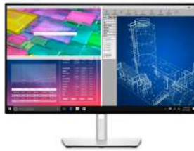
Dell Ultrasharp 27 Monitor - U2722D (x2)

Create phenomenal 4K HDR content on the world's first professional monitor with 2K mini-LED direct backlit dimming zones.*