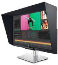
Dell UltraSharp 32 HDR PremierColor Monitor - UP3221Q

Create phenomenal 4K HDR content on the world's first professional monitor with 2K mini-LED direct backlit dimming zones.*