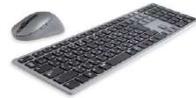
Dell Premier Multi-Device Wireless Keyboard and Mouse - KM7321W

Elevate your productivity on this innovative 27-inch QHD Hub monitor with a wide color coverage including DCI-P3. Features ComfortView Plus an always-on built-in low blue light screen, USB-C with up to 90W power delivery, and RJ45 connectivity.