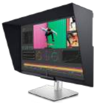
Dell UltraSharp 32 HDR PremierColor Monitor - UP3221Q

Create phenomenal 4K HDR content on the world's first professional monitor with 2K mini-LED direct backlit dimming zones.*