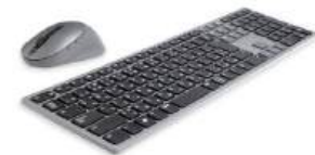
Dell Premier Multi-Device Wireless Keyboard and Mouse - KM7321W

Elevate your productivity on this innovative 27-inch QHD Hub monitor with a wide color coverage including DCI-P3. Features ComfortView Plus an always-on built-in low blue light screen, USB-C with up to 90W power delivery, and RJ45 connectivity.