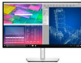
Dell UltraSharp 27 Monitor - U2722D

Create phenomenal 4K HDR content on the world's first professional monitor with 2K mini-LED direct backlit dimming zones.*