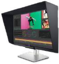
Dell UltraSharp 32 HDR PremierColor Monitor - UP3221Q

Create phenomenal 4K HDR content on the world's first professional monitor with 2K mini-LED direct backlit dimming zones.*