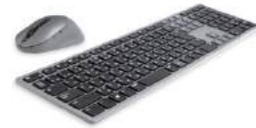
Dell Premier Multi-Device Wireless Keyboard and Mouse - KM7321W

Elevate your productivity on this innovative 27-inch QHD Hub monitor with a wide color coverage including DCI-P3. Features ComfortView Plus an always-on built-in low blue light screen, USB-C with up to 90W power delivery, and RJ45 connectivity.