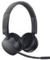
Dell Pro Wireless Headset - WL5022

Multi-task seamlessly across 3 devices with this premium full-size keyboard and sculpted mouse combo featuring programmable shortcuts and 36 months battery life.