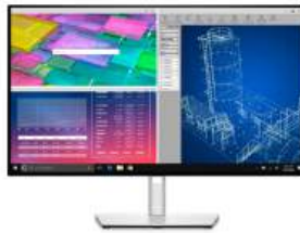
Dell UltraSharp 27 Monitor - U2722D

Create phenomenal 4K HDR content on the world's first professional monitor with 2K mini-LED direct backlit dimming zones.*