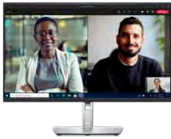
Dell 27 Monitor - P2723D

Create your ideal workspace with these recommended accessories.