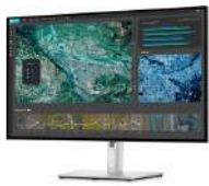
(2x) UltraSharp 27 4K Monitors - U2723QEW

Be your most productive on a 27 inch monitor with brilliant color and contrast that features the industry's first IPS Black technology and a connectivity hub.